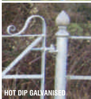
HOT DIP GALVANISED

All products can be supplied in a choice of finishes.